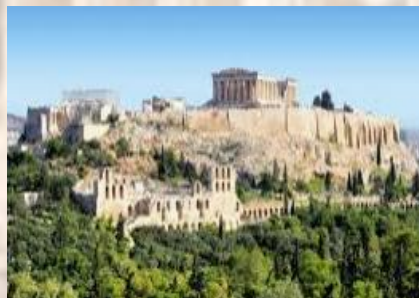
Acropolis Virtual Tour https://www.acropolisvirtualtour.gr/