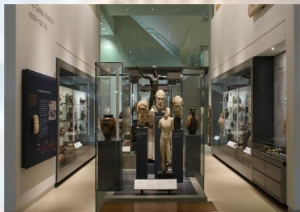
Ashmolean Museum, Oxford