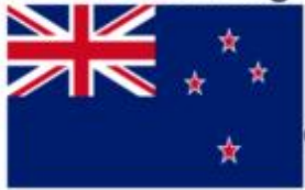
New Zealand flag