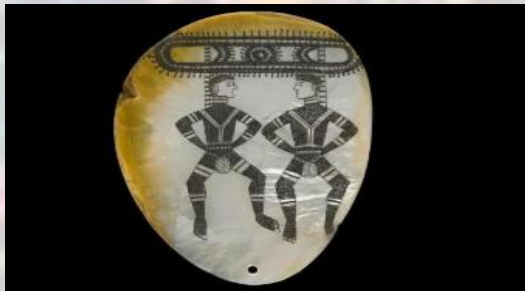
British Museum, London