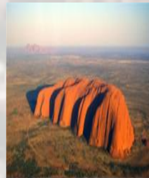
Uluru - Ayers Rock

↓ Tripadvisor: Can you use a variety of sources to research and present information about a country in North America?