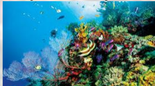
Virtual Tour of The Great Barrier Reef, (See 'Useful Links')