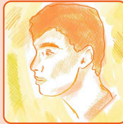
Relaxed and happy