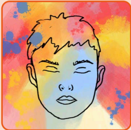
Wash of paint

Match the materials you choose to the effect you want to create