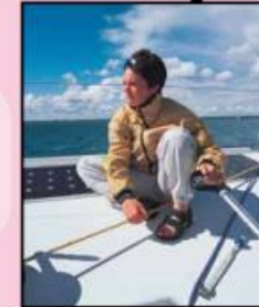
Matthew Henson 1909