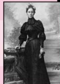
Mary Kingsley 1893