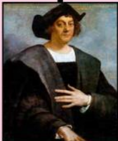
Christopher Columbus 1492