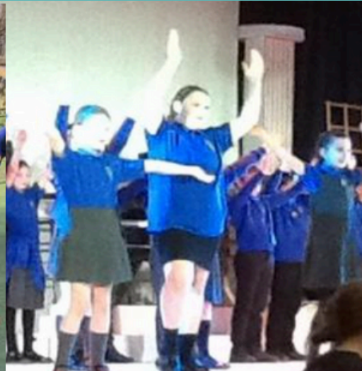
A snap shot of the term!