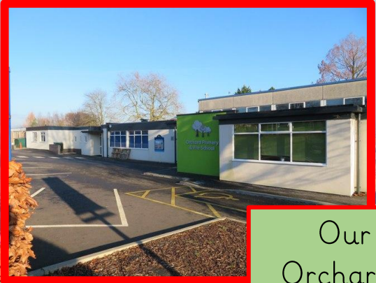
Our school! Orchard Primary and Preschool